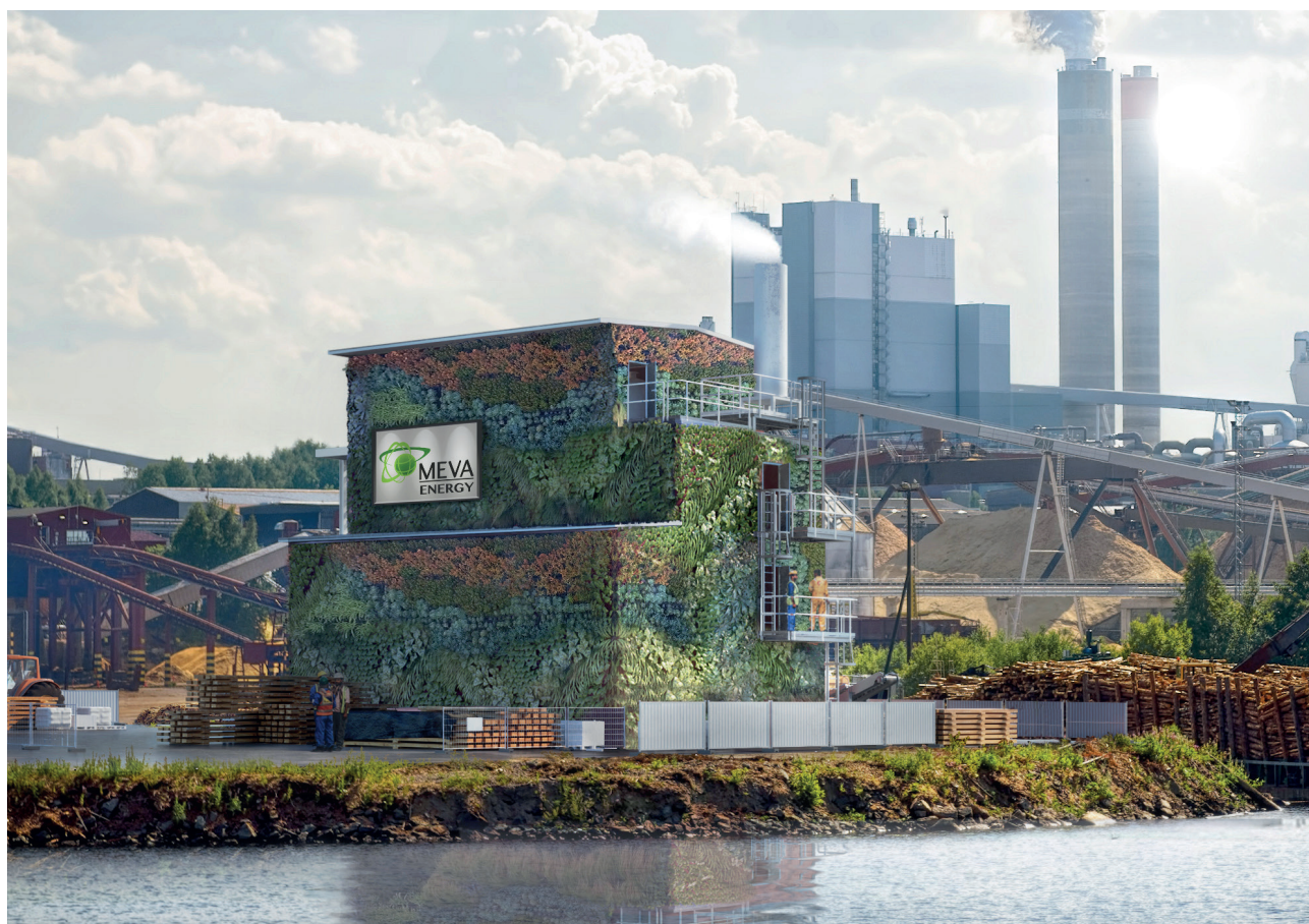
Figure 1. A Meva Energy gasification unit at a paper mill supplying renewable gas.

By Thomas Bräck , Business Development Director, Meva Energy AB