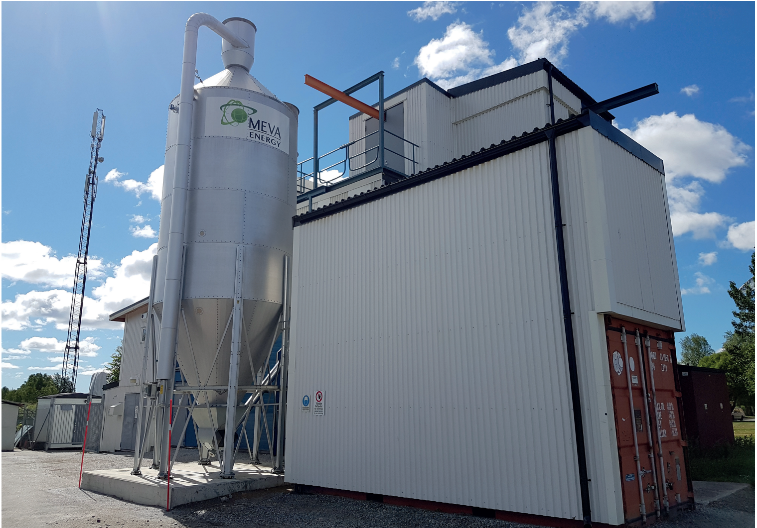
Figure 4. The Hortlax Plant.